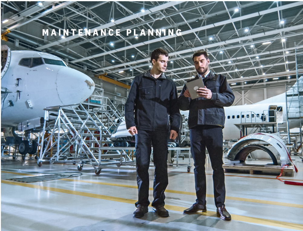
Left: Immediate gains in digitalisation are cost and process streamlining Below: Aerogility's CEO Gary Vickers sees power in model-based AI systems in adapting to frequent fluctuations in demand